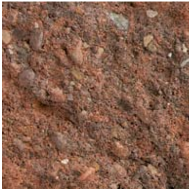
Earth Brown and Golden Blend