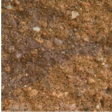
Montana Brown and Sandstone Blend