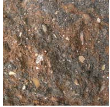
Brownstone Brown and Charcoal Blend