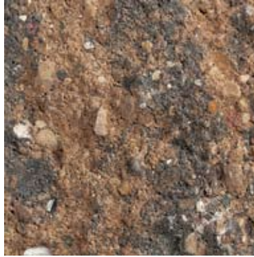
Country Sandstone and Charcoal Blend