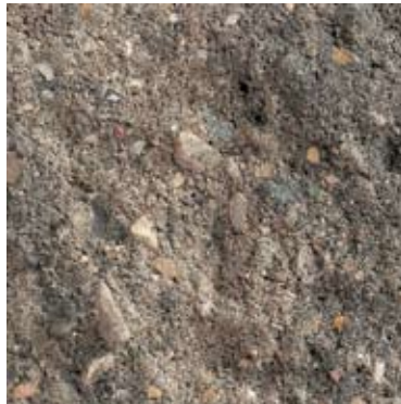
Granite Gray and Charcoal Blend