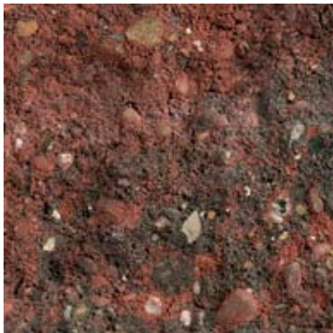
Antique Red and Charcoal Blend