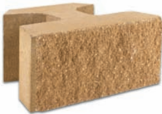
Straight Split Size: 8" H x 18" W x 12" D 200mm x 450mm x 300mm Weight: 80 lbs., 36 kg

Unit specifications, availability, color, and fascia options vary by manufacturer. Please contact your nearest Rockwood manufacturer or dealer for more information.