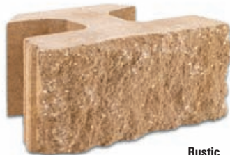
Rustic Size: 8" H x 18" W x 12" D 200mm x 450mm x 300mm Weight: 80 lbs., 36 kg

ROCKWOOD ® RETAINING WALLS A better way.™