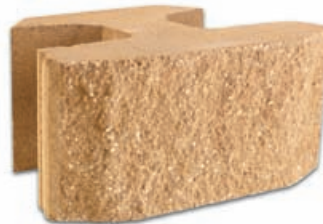
Beveled Split Size: 8" H x 18" W x 12" D 200mm x 450mm x 300mm Weight: 80 lbs., 36 kg